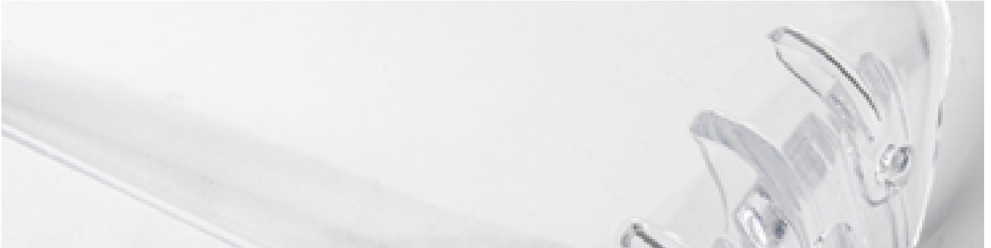
Example of SLA printed (clear ABS material) part with a polished finish